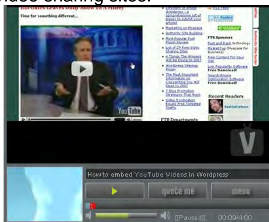
Click the Pic to See The Vid Above

We do all our screen capture videos with Camtasia. Here is a sample I did and then syndicated to all the free video sharing sites: