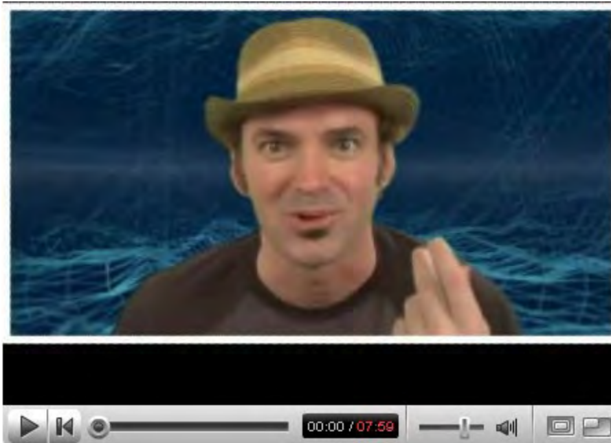
Making a Cool 3d Logo For Video

How to make awesome green screen (chroma key). part 1.